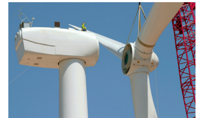
In conjunction with imc CANSASflex, distributed measurements can be carried out quickly and safely.