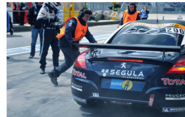
Thanks to its lightweight, compact design, the imc BUSDAQflex is ideal for vehicle testing.

The new data logger is perfectly complemented by the imc CANSASflex series measurement modules. Thanks to the click mechanism, the modules can be directly attached to the logger without tools and cables. In a very short time, a complete measurement system that can synchronously record and store all data can be made from a pure field bus logger.