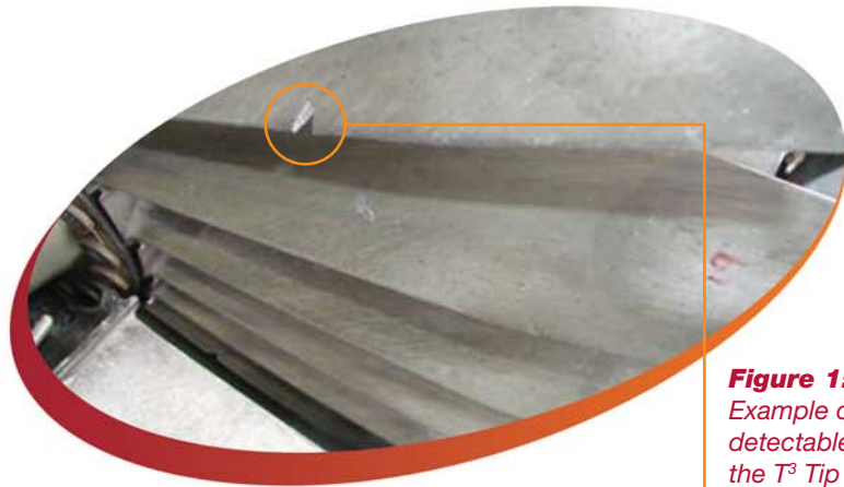
Figure 1: Example of FOD detectable with the T 3 Tip Timer

It delivers high quality, in-service blade health data and is ideal for use in condition monitoring, predictive maintenance and detection of foreign object damage (FOD) in both ground-based and airborne turbine systems.