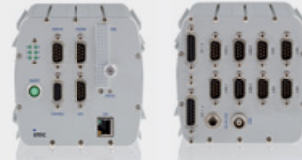
imc BUSDAQ-X Multibus data acquisition system size (W x H x D): 185 mm x 110 mm x 110 mm weight: 2 kg with 8 nodes